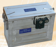
Nickel Cadmium Battery NC - 001