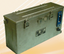
Nickel Cadmium Battery NC - 253