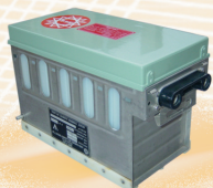
Nickel Cadmium Battery FTNC - 0155