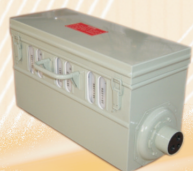
Nickel Cadmium Battery FTNC - 0303