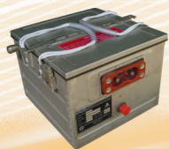
Nickel Cadmium Battery NC - 252