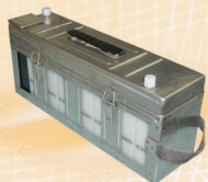
Silver Zinc Secondary Battery SIMEC 56-15-1