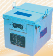
Nickel Cadmium Battery FTNC - 0101